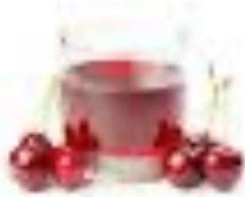
Tart cherry juice